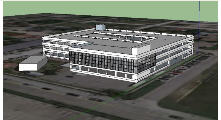
City Hall/Transportation Center Conceptual Rendering

Not resting on our laurels, there is additional planning and work preparing for additional improvements that are also on the horizon. In 2017 TxDOT is scheduled to move forward on construction of the SH 146 expansion. City Council has also embraced the concept of one-way streets within the Lighthouse/Business District, in conjunction with TxDOT's highway improvement plans. A proposed secondary street connecting from FM 518 to SH 96 in developing areas has also been discussed as a local traffic route to improve connectivity. City Council has also supported the Coastal Barrier alternatives being studied by Texas A&M Galveston, and will also work with our partners to seek additional water resources that are critical to maintain current development and future growth.